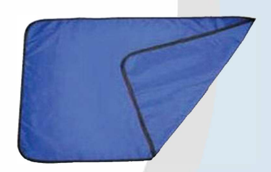
TABLE SHIELDING DRAPES

Nylon-covered 0.50mm equivalent protective blanket may be used for shielding patients or equipment.